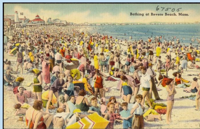
Bathing at Revere Beach, Mass.