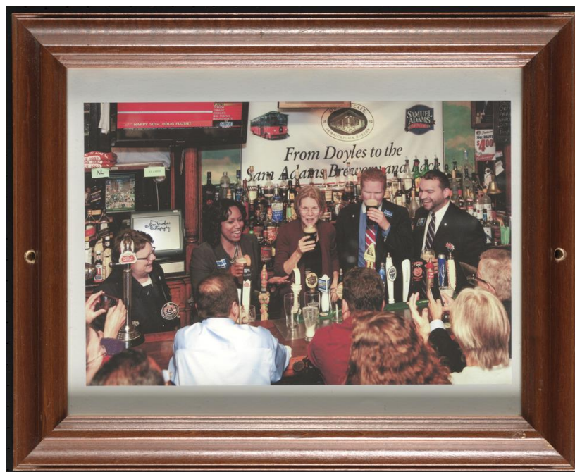
Elizabeth Warren behind the bar at Doyle's, October 23, 2012

Doyle's Cafe was a popular community gathering space on Washington Street in Jamaica Plain. Doyle's opened its doors in 1882 and was also known as a favorite gathering place for both local and national politicians. Doyle's closed on October 26th, 2019. The Doyle's Cafe Memorabilia collection features the photographs, news clippings, ephemeral materials, and other decorations that hung on Doyle's walls. While the physical items were sold at auction, their memory is preserved through the digital images held by the Jamaica Plain Historical Society.