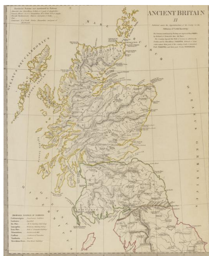
Map of Ancient Britain II, J&C Walker, 1834

Finos started collecting maps while browsing through an antique nautical shop in Chatham, Massachusetts and found 16th- and 17th-century atlases and maps to be especially interesting. The oldest maps in this collection are cityscapes and some maps are more like guidebooks for getting from here to there. Many of the items in this collection are tied to places with a family, work, or other personal connection for Ralph Finos: northeast Italy, Japan, and the Maine coast. View the full collection here .