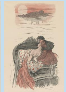
Ballade en Mer