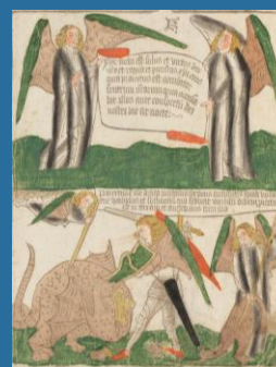
Selected Items Newly Added to the Collection