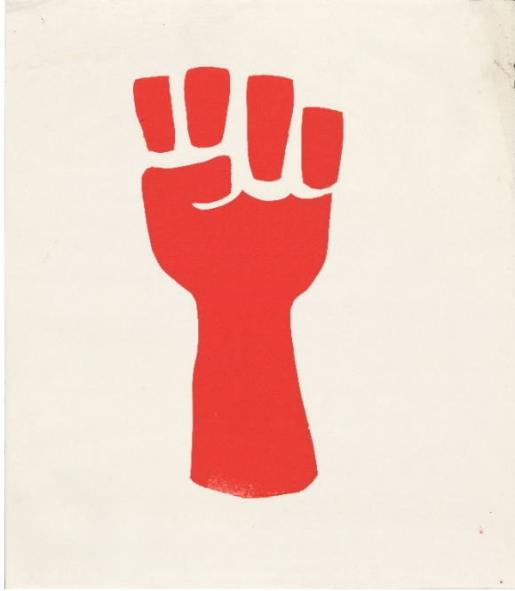
Power Fist circa 1969-1974, Metcalf Hall Protest Posters, http://hdl.handle.net/10427/015587