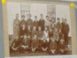
Handwritten caption describing the group in the photograph above.