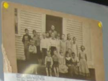
Handwritten caption describing the group in the photograph above.