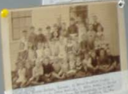
Handwritten caption describing the group in the photograph above.