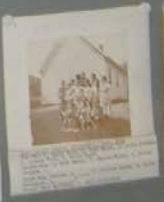
Handwritten caption describing the group in the photograph above.