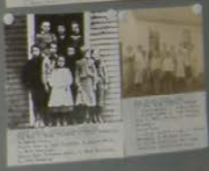
Handwritten caption describing the group in the photograph above.