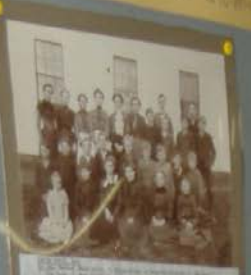
Handwritten caption describing the group in the photograph above.