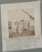
Handwritten caption describing the group in the photograph above.