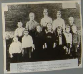
Handwritten caption describing the group in the photograph above.