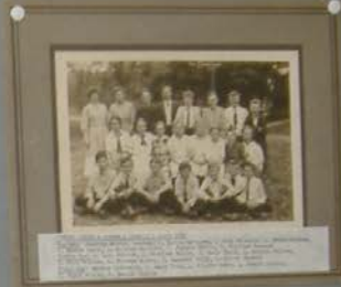
Handwritten caption describing the group in the photograph above.