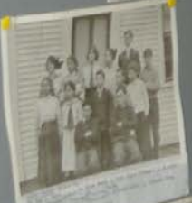
Handwritten caption describing the group in the photograph above.