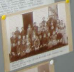
Handwritten caption describing the group in the photograph above.