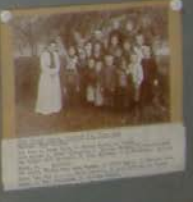
Handwritten caption describing the group in the photograph above.