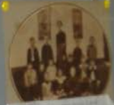
Handwritten caption describing the group in the photograph above.