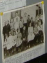
Handwritten caption describing the group in the photograph above.