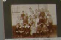
Handwritten caption describing the group in the photograph above.